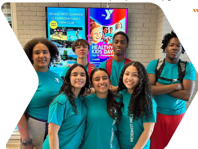
Y Teens coming together at our Y facility in Framingham.

"I am so glad that my mom encouraged me to participate in the Changemaker Academy. I made friends with people who I never would have met. I worked in Childwatch which has inspired me to one day become a pediatrician."